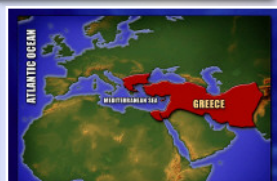
Ancient Empire of Greece

2 - "The gr_at ho_n that is b_tween his eyes is the first k_ng."